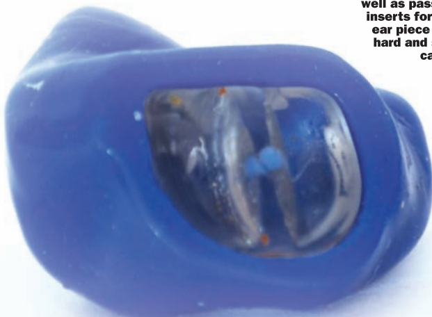
Each set comes with active as well as passive inserts for the ear piece and hard and soft cases

Controls consist of a 3-position, rotary ON/OFF and volume switch; black is off, green medium and red high gain. Generally most people with average hearing will find green the normal setting; increasing the volume is more for those with poor hearing and will act more like an